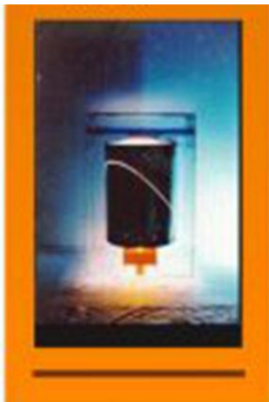
Figure 1: Original AFM used in the Nova U. Biofeedback Study.

The purpose of the study was to compare the ability of the left and right hemispheres of the human brain to control autonomic variables. The variable of interest was the amounts of time to recover from startle induced elevation in bilateral skin conductance levels and heart rate. The methodology used, called Unilateral Repetitive Activation, is based on a hypothesis which suggests a decrease in contralateral interference when one hemisphere is repeatedly presented with information known to be processed more efficiently in that hemisphere.