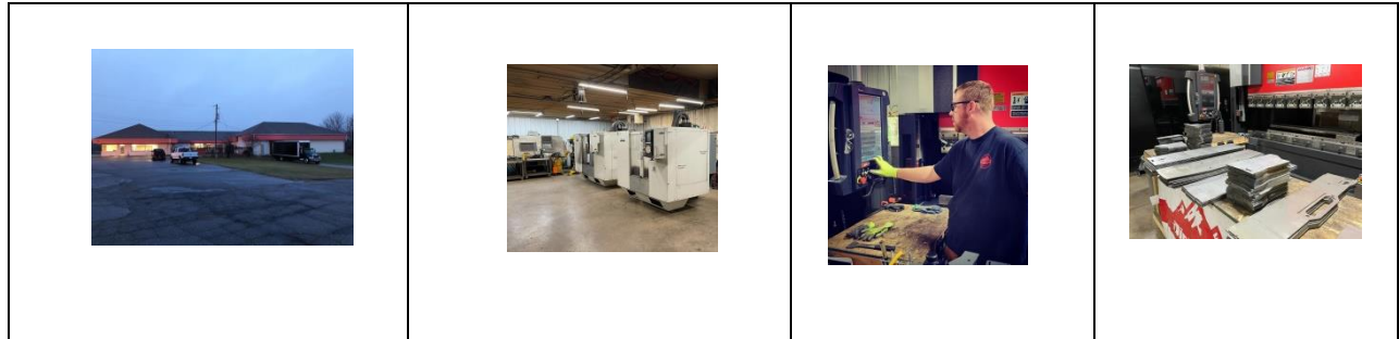
Figure 2: The Dirtbound Fabrication Facilities in Chisago City, MN.